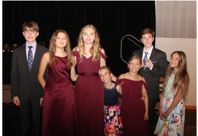
FCIA family. What it's all about.

This year's event was particularly special because families joined the celebration. They even had their own (dreaded) kids table! You know, that was one of the goals of the founding FCIA Board of Directors. They wanted to create a place where career-long relationships and bonds can be formed, with some of these connections becoming extended family. Yes, FCIA works on Standards, Codes, Accreditation, and more, but to connect and become life-long partners, friends, and (yes) family, that's what makes FCIA so much more than just a trade Association. When we invest in each other, we are so much more committed to each other's long-term success.