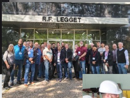
The group was able to tour the NRC Fire Test Facility in Ottawa, ON and hear from NRC Staff on the fire test process.